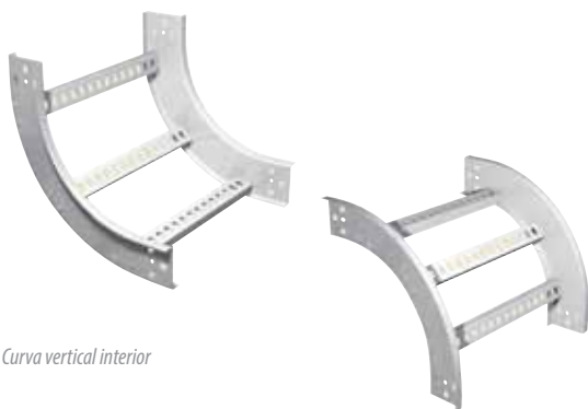
Curva vertical interior