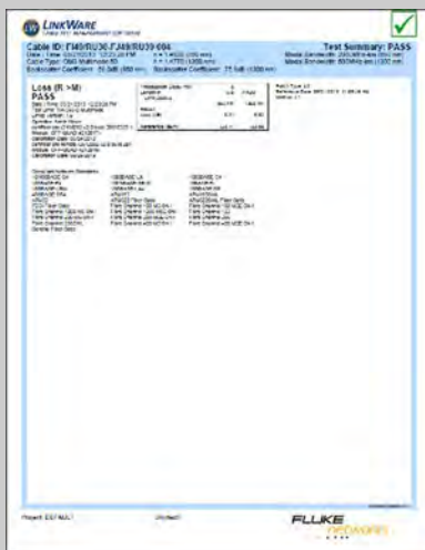
Encircled Flux and Test Reference Cords Tested