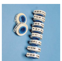
PMDR - * - *