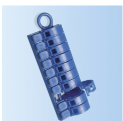
PMD EMPTY DISPENSER