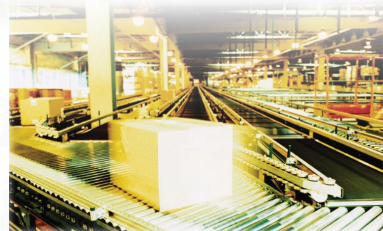
Sample application of conveying equipment in a material handling process.

ArmorBlock I/O and ArmorBlock Guard I/O blocks are best-suited for automotive, material handling and packaging applications.